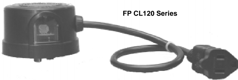
FP CL120 Series